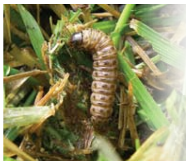
A webworm caught in the act.

GREENBUG APHIDS – Like chinch bugs, suck juices from grass plants while injecting a toxin.