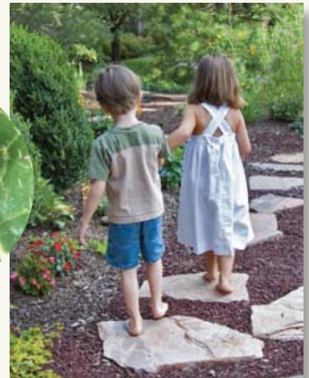
Deer ticks are responsible for the spread of Lyme disease.