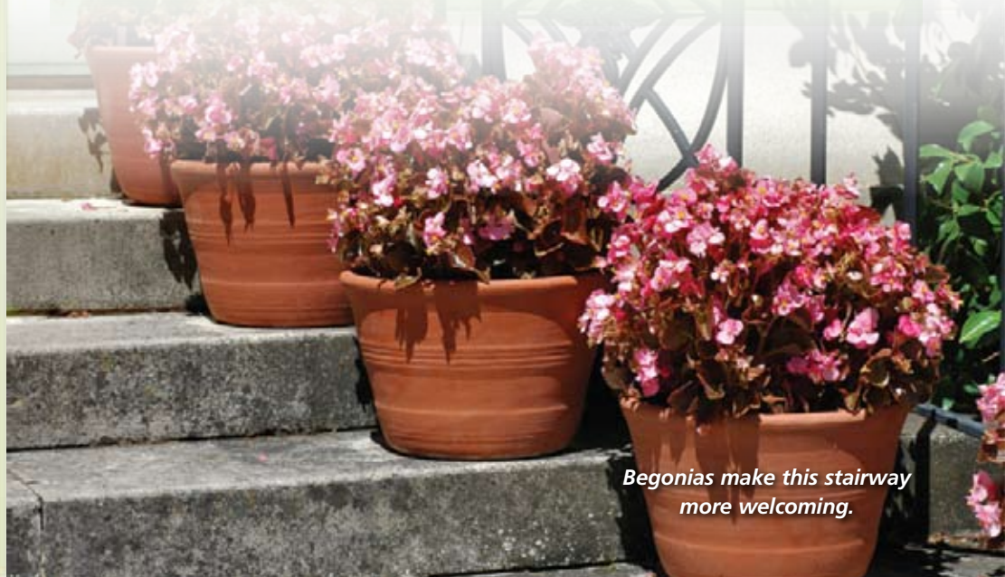
Begonias make this stairway more welcoming.